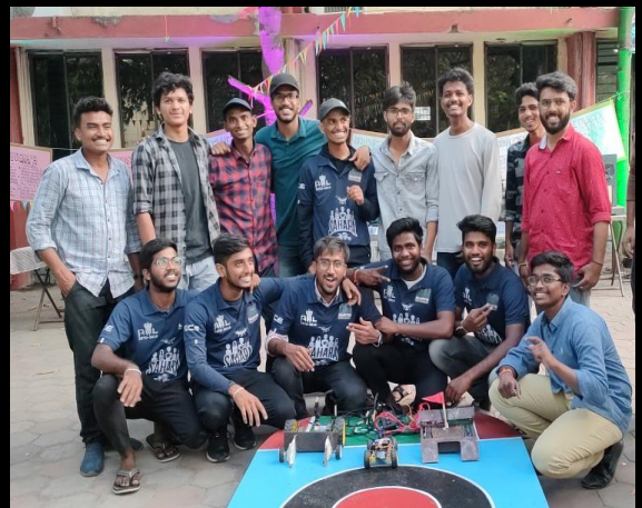
Students participating in Tech Feast